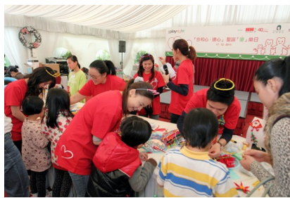
<Photo 4> Child patients enjoy the fun of playing at various play zones designed by the Hospital Play Youth Ambassadors.