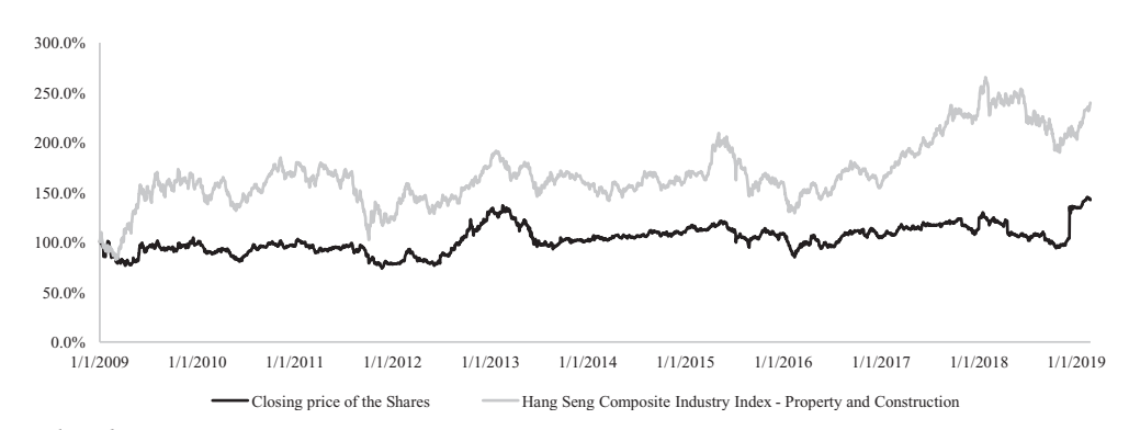
Chart 2: Comparison of performance of Share prices with the Industry Index

Note: For comparison with the Cancellation Price, the Share prices in chart 1 are adjusted for abnormal cash dividends based on adjustment methods adopted by Bloomberg.